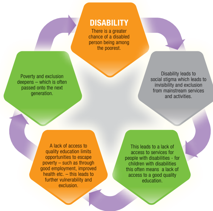
Figure 2. Cycles of poverty and exclusion