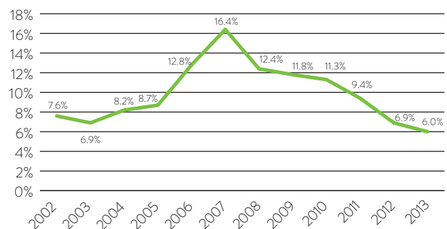
FIGURE NE2: The Netherlands Total aid to education as % total ODA 2002–2013

The previous very high commitments from the Netherlands were driven by the ground-breaking commitment made in 2001, when the Dutch parliament passed a motion to increase aid expenditure for basic education to 15% of aid overall. Although this percentage was never actually realised, this decision implied a phenomenal level of support