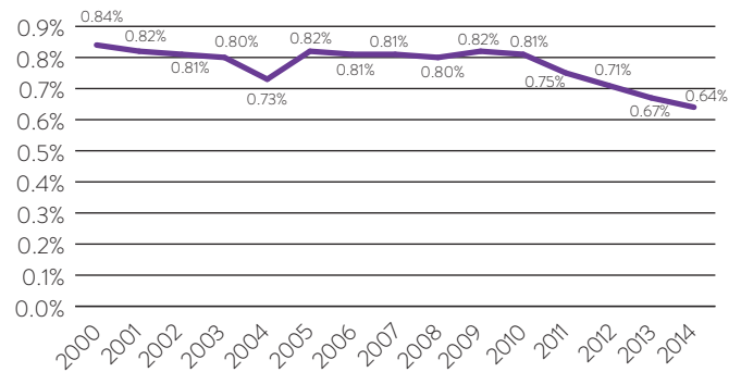
FIGURE NE1: The Netherlands Total ODA as % GNI, 2000–2014