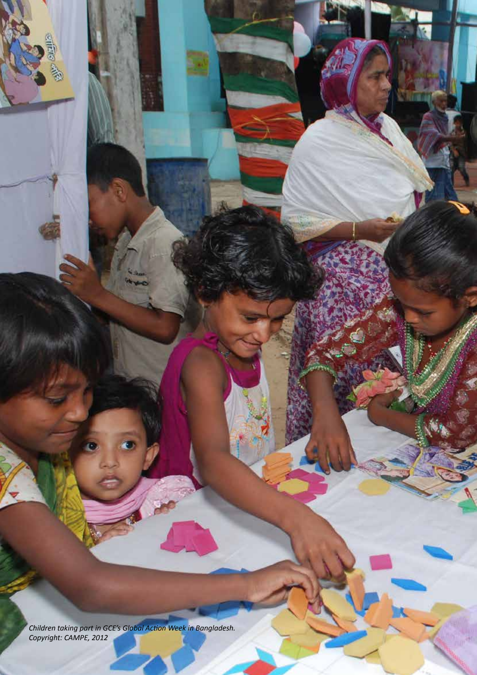
Children taking part in GCE's Global Action Week in Bangladesh.